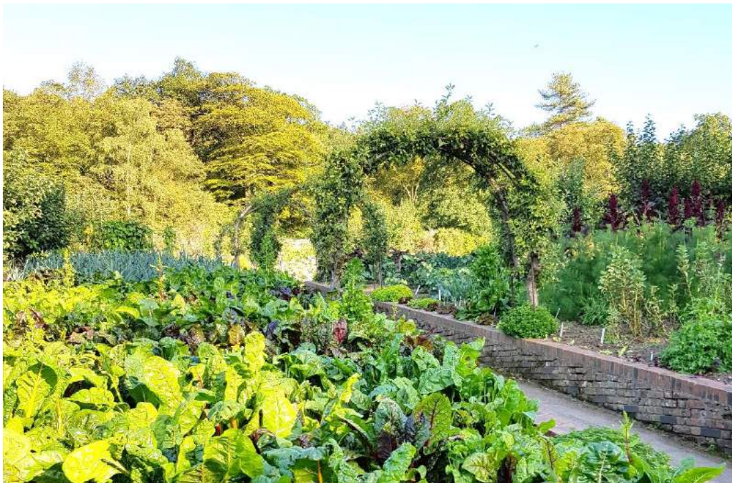
The Kitchen Garden at Chatsworth, where we engage schoolchildren in learning about growing food, pollination and the life cycle of plants.

Parents & Teachers: You can find the relevant curriculum links at the end of the resource.